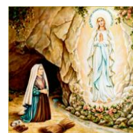
APPARITION DATE TIME Friday July 16 6:00 pm